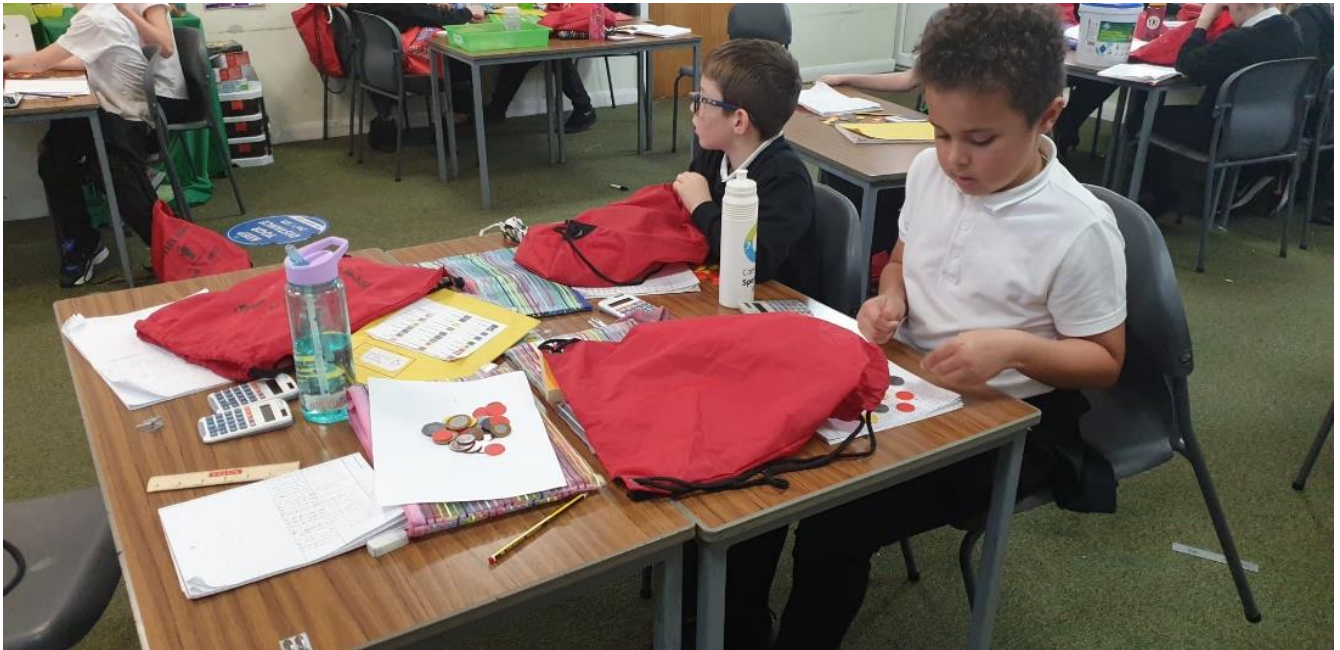
And some used money and counters. In fact he had everything out!