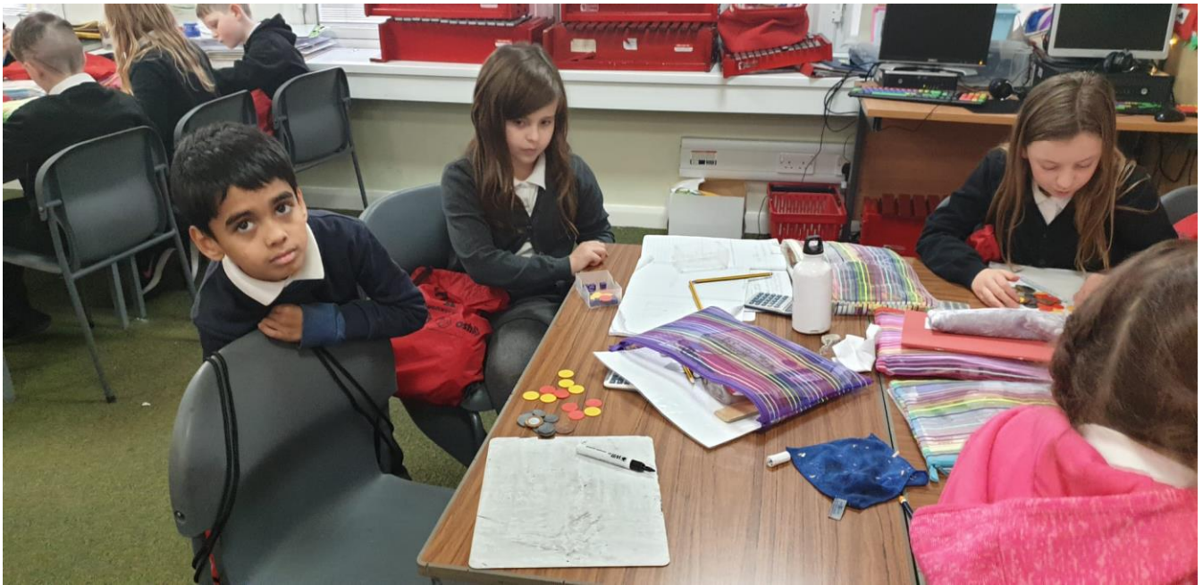
In the same lesson some went for counters from the kit. The dual sided counters are very helpful in all sorts of bar model type work.