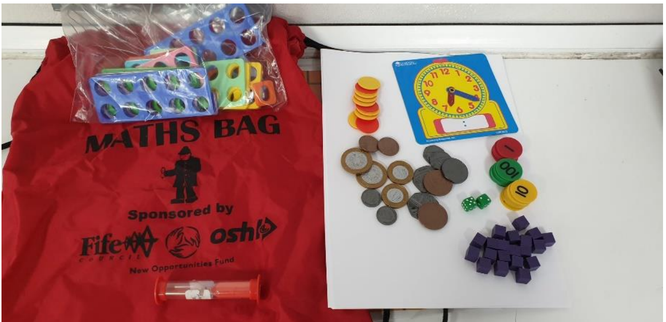
Here is the basic kit. Since this photo was taken ten rods have arrived and we have added number mats, money in the form of notes, hundred squares, blank numberlines etc.